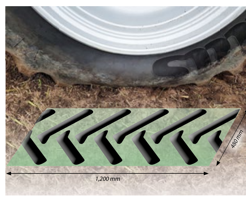
The 480/95 R50 tires have a very large contact surface and at the same time low tire pressure to prevent damaging soil compaction.